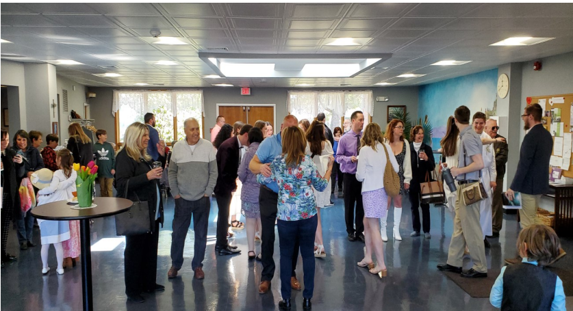
Fellowship in the Narthex on Easter Sunday

I have noticed an increase of participation in events and programs which is very exciting. I have seen fellowship after Sunday service grow, both in the number of members staying after worship and the length that we stay. That is the family of Grace getting to know and love each other. OUTSTANDING! You will see some updates to the Narthex in the coming months to make our space even more welcoming and warm for that fellowship time together, so be on the lookout. Also, I would like to challenge all of you to try your very best to talk to at least three people after each church service (It's OK if you forget someone's name, we all do it! – Just ask again, again and again).